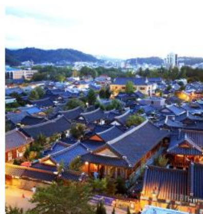
Photo: Boseong Green Tea Plantation Yeosu Cable Car Jeonju Hanok Village Suncheonman Bay